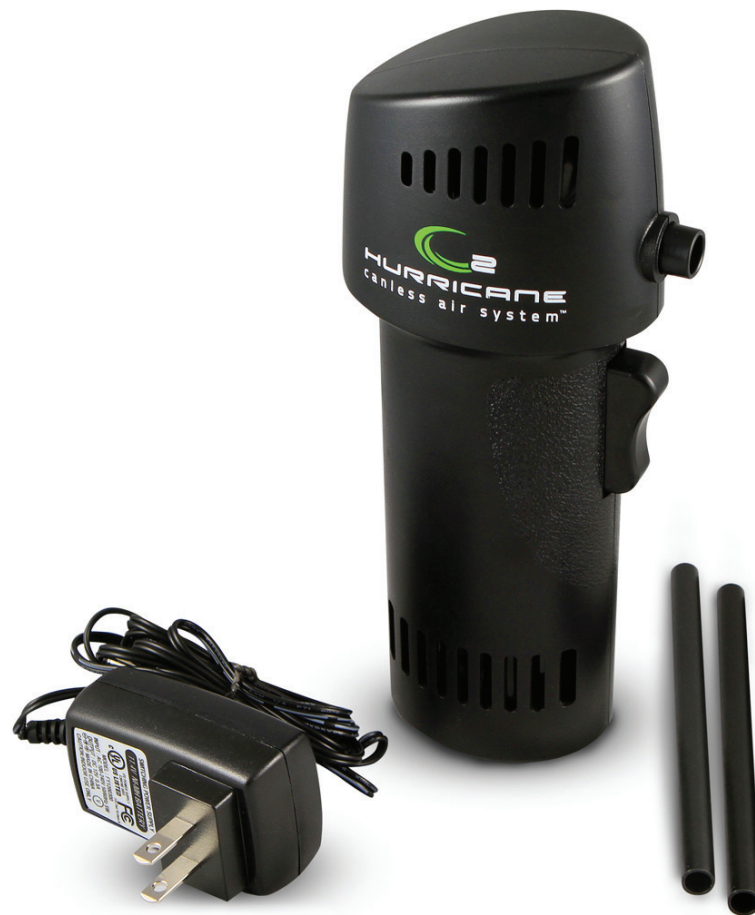
The O2 Hurricane canless air system is an easy, environmentally save alternative to canned air.

The O2 Hurricane sells for $99.95 MSRP (currently on sale for $79.95) plus shipping